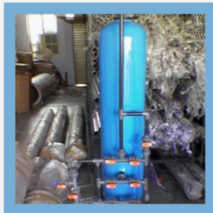
Water Polishing Unit