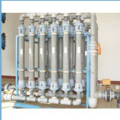
Effluent Treatment System