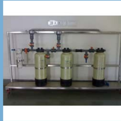
Demineralisation Lab Model