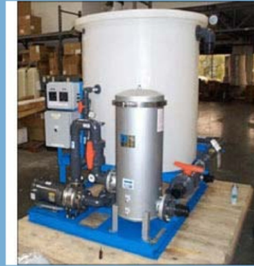
Reverse Osmosis Cleaning System