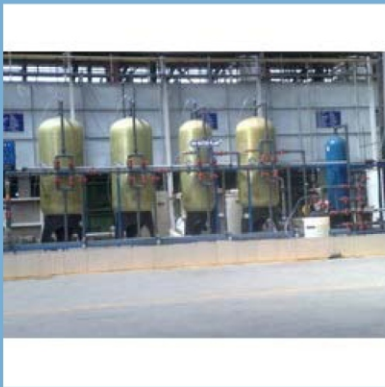
Demineralization & Water Softener