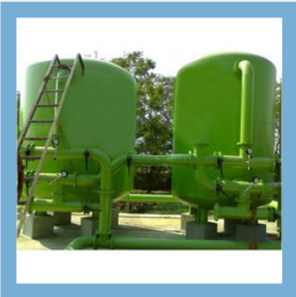
Filter 150 M3HR

We supply wide range Industrial Filters which include filter 150 M3HR, filter SS, filter, cartridge filter SS type, FRP filtration and cartridge filter PP type. We offer these in various sizes, dimensions and can be customized as per clients' specifications.