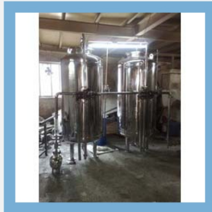
Stainless Steel Filters