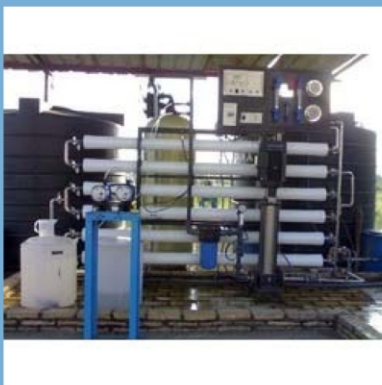
Reverse Osmosis PVC Tube