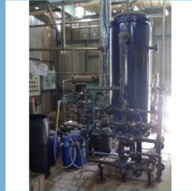
Auto Mixed Bed Demineralisation Plant