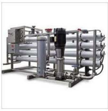
Zero Discharge Systems

We are one of the Traders and Manufacturers of a huge assortment of Effluent Treatment System . These include zero Discharge Systems. This zero discharge system contains the effluent treatment plant. This equipment is to recycle the waste of wastewater, to be reused.