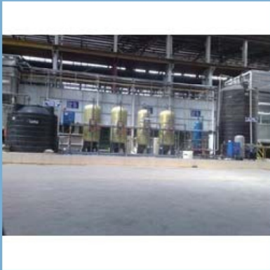
Demineralisation Plant Con

Our clients can avail from us a superior range of Demineralisation Plant that is easy to use and requires less maintenance. Our experts design these plants in accordance to industry standards.