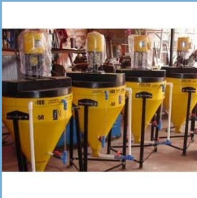
Dosing System - Conical Type

We are one of the prominent Traders and Manufacturers of the best quality range of Dosing System . The enormous array of systems offered by us include Dosing System - Conical Type, Dosing System -Flat Tanks, Dosing System H.P. Type and Dosing Systems that are sourced from Pune, Maharashtra, India.