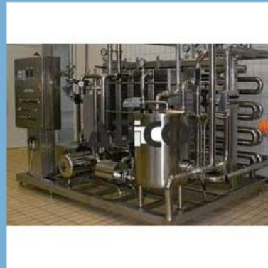
Food Processing Plants