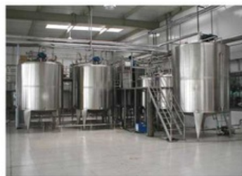
Juice Process Line