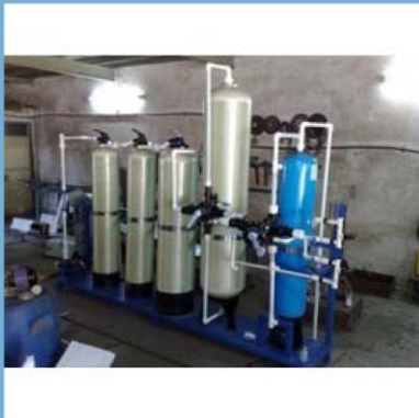
Mixed Bed Demineralisation Systems