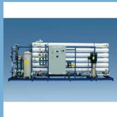
Reverse Osmosis System