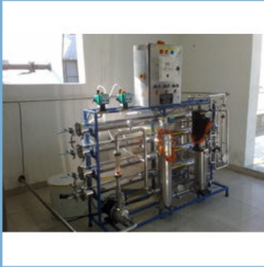
Reverse Osmosis Plant

We manufacture and supply a high quality range of Reverse Osmosis Plant to our clients. Our ranges of products include different types of products such as RO Cleaning System, Reverse Osmosis Plant, Reverse Osmosis System, RO PVC Tube and R O Pharma.