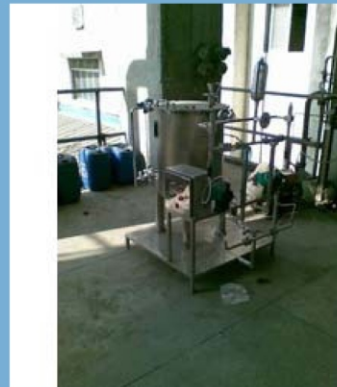
Dosing System H.P. Type