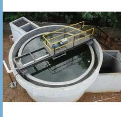
Waste Recycle Plant