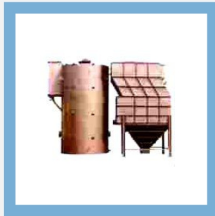
Tube & Plate Settler Systems