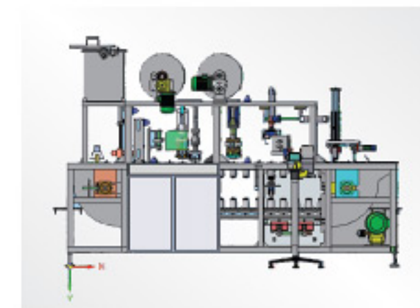
For sealing of Plain / Printed laminated film in roll form.