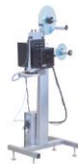
P100 with vertical stand and print & apply module