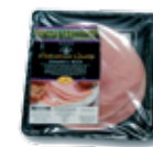
Flexible packaging label