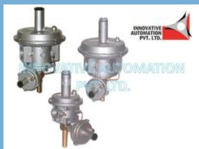
Gas Pressure Regulators with Inbuilt Safety Shut off 2 Bar