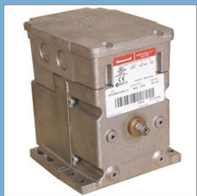
Honeywell Modulating Motors

Actuators and Motorised valves , a motorized valve actuator includes an electric drive motor having a rotatable shaft for providing an actuating torque.