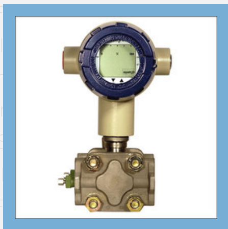
Honeywell Pressure Transmitters

Flow can be measured with many types of sensors: pressure transducers, bubblers, shaft encoders, or ultrasonic sensors. The location where you are measuring water level, the accuracy required. Flow & Pressure Transmitters are effectively used for many types of fluid.