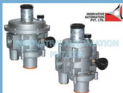
Gas Pressure Regulators with Inbuilt Safety Shut off 5 Bar