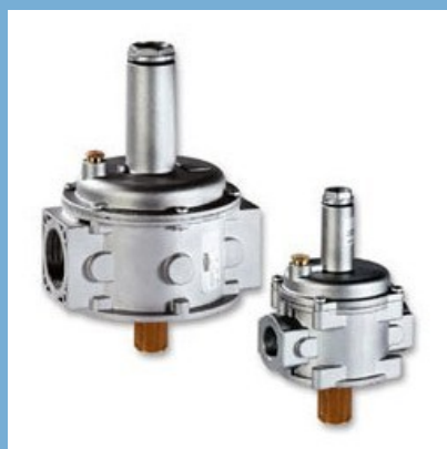
Slam Shut Off Valve