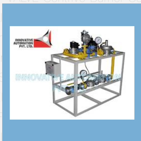
Loop Design Prepiped Gas Trains