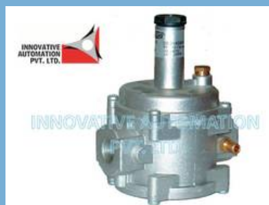
Gas Pressure Regulators and Filter Regulators for Small User