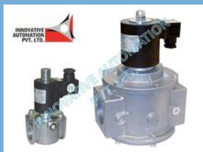
Automatic Reset Type Normally Open Solenoid Valves