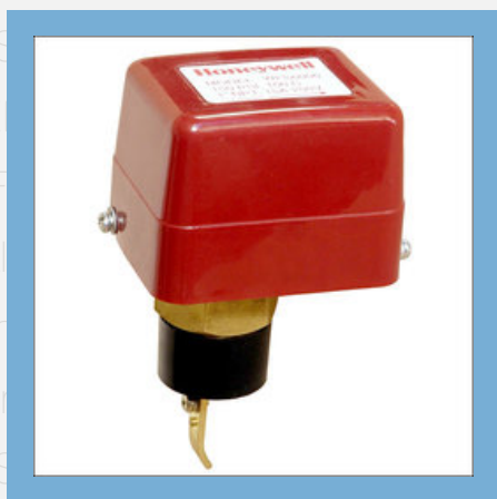
Water Flow Switches