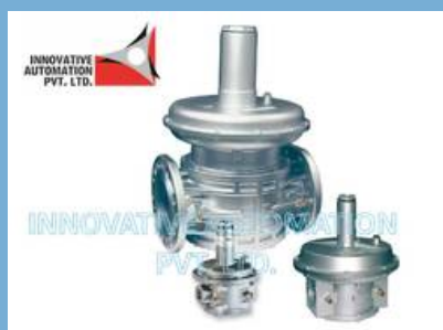
Gas Pressure Regulators and Filter Regulators 2 Bar