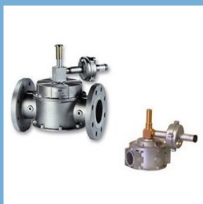
Pressure Relief And Vent Valves

Safety Shut Off Valves, also called as Slam Shut Off Valves or Over Pressure Shut Off valves protect the Low Pressure Rating Components after the Gas Pressure Regulator in case of accidental increase of Outlet Pressure.