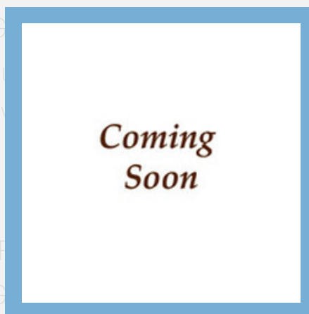
DCP Programmable Profile Controllers