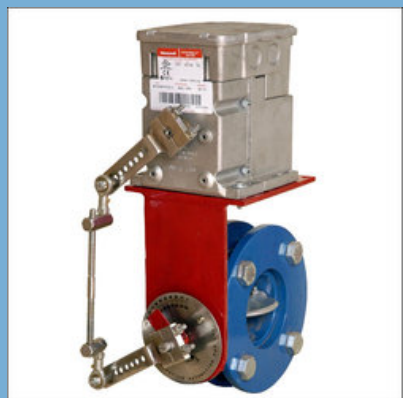
Motorised Butterfly Valves