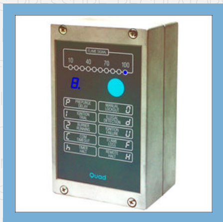
Quad Burner Controller

Contrive burner controller are meant for gas & oil burners.