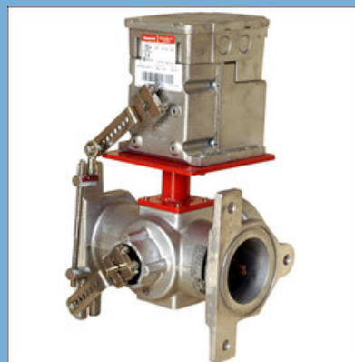
Motorised Adjustable Port Valves