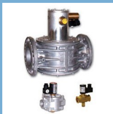
Manually Reset Type Normally Closed Solenoid Valves