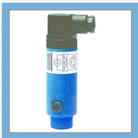
UV Flame Sensors