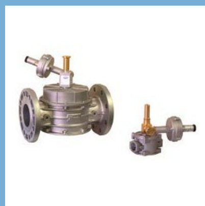
Pressure Relief Valves