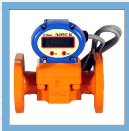
OVAL Oil Flow Meters