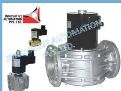
Automatic Closed Type Normally Closed Gas Solenoid Valves