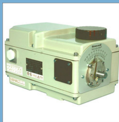
Honeywell Hercule Series Actuators