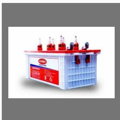
12 V 100Ah Jumbo Tubular Battery