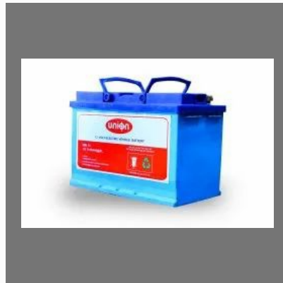
12 V 85Ah Semi Traction Battery