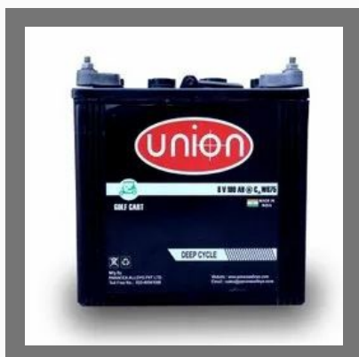
180 Ah Deep Cycle Golf Cart Battery