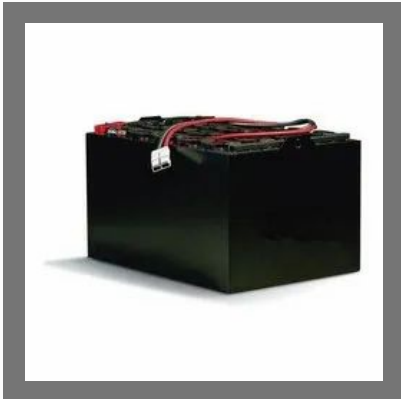
80 V Lead Acid Battery