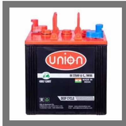
6 V 225ah Golf Cart Battery