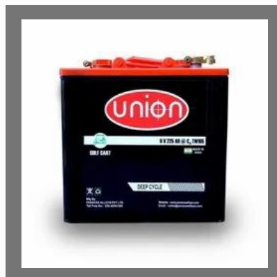
6V 225 Ah Deep Cycle Golf Cart Battery