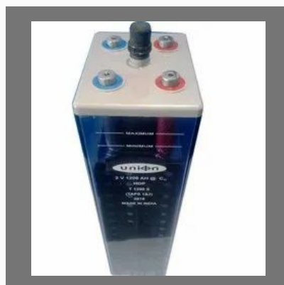
2V 150 AH to 1200Ah Stationary Battery