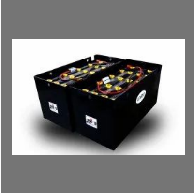
48 V Lead Acid TRACTION Battery