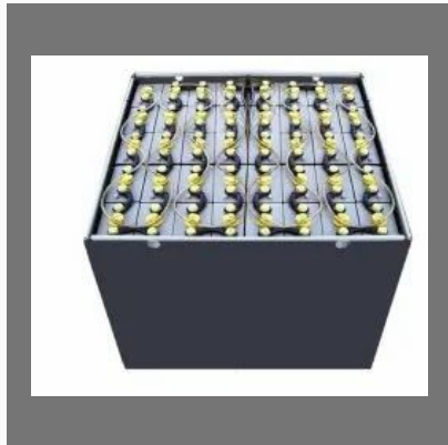
80 V 180 To1500Ah Traction Battery