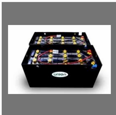
Traction Forklift Batteries