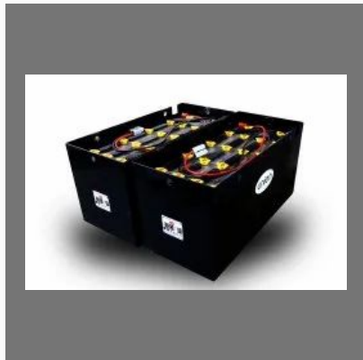
2X 18V 300 Ah (Split Type) Traction Battery