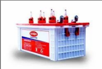
12 V 150Ah Jumbo Tubular Battery