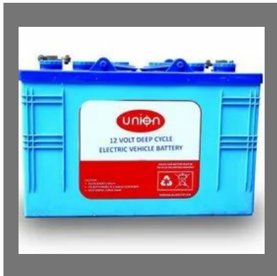
12 V Deep Cycle Electric Vehicle Battery