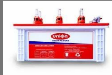
12 V 160Ah Jumbo Tubular Battery