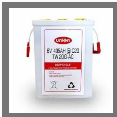
6V 435AH Deep Cycle Battery for Manlift/scissorlift/Boomlift application