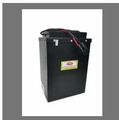
Lithium Ion Battery