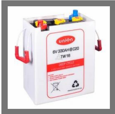
6V 330 Ah Deep Cycle Electric Vehicle Battery