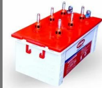
12 V 180Ah Jumbo Tubular Battery