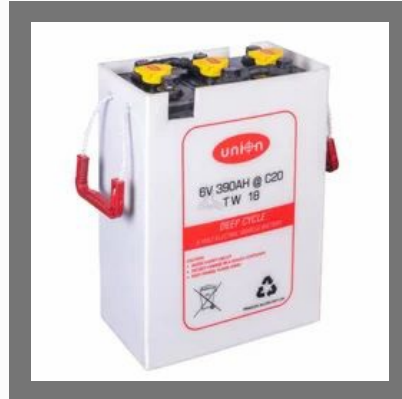
6 V 390Ah Deep Cycle Electric Vehicle Battery