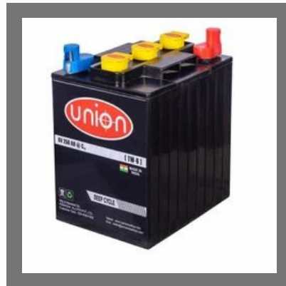
6V 250Ah Deep Cycle Electric Vehicle Battery