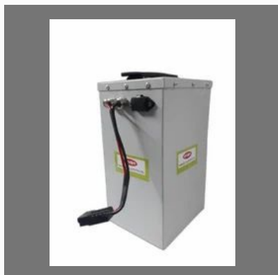
Lithium Ion Battery