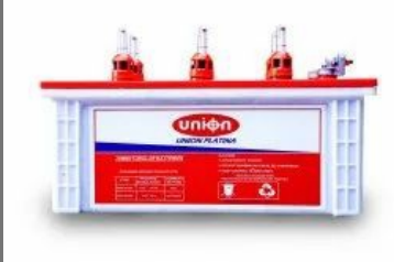
12 V 200Ah Jumbo Tubular Battery