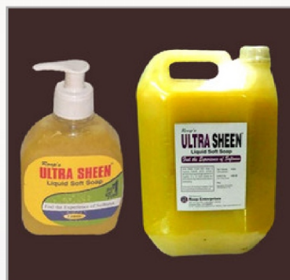
Liquid Soft Soap