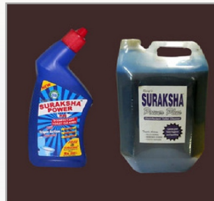
Disinfectant Toilet Cleaner