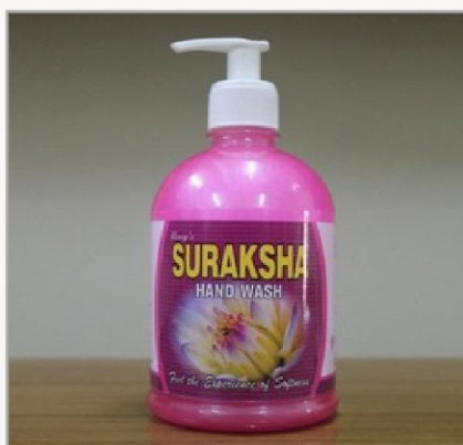
Liquid Soft Sort Soap