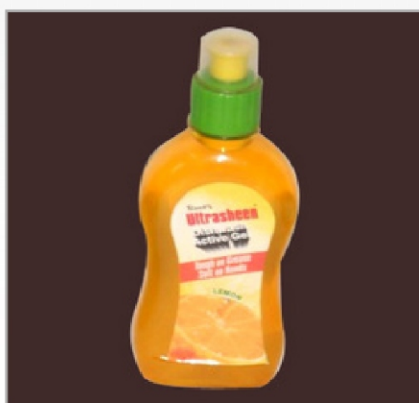
Dish Wash Active Gel