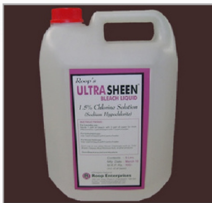
Bleach Liquid Stain Remover