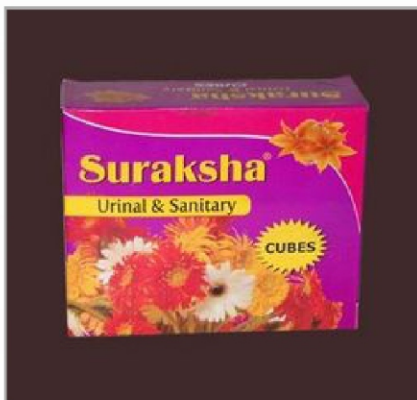
Urinal & Sanitary Cubes