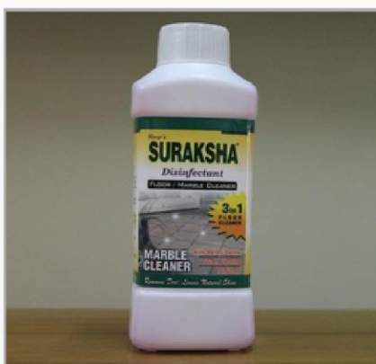
Disinfectant Floor Cleaner

It is a essential oil for cleaning floor of your rooms, bathrooms & toilets. It is very economical. These are completely safe and contain on CFC's and hence widely demanded in various residential and commercial establishments.