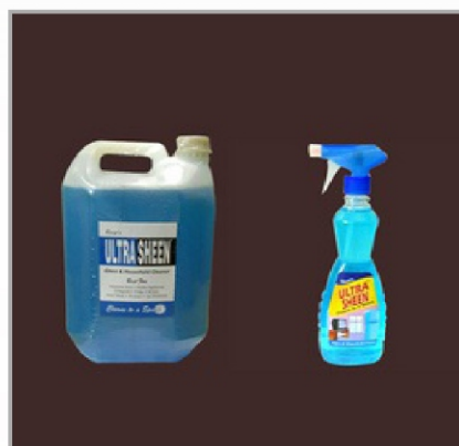
Glass & Household Cleaner