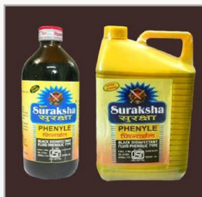
Black Disinfectant Fluid Phenolic Type