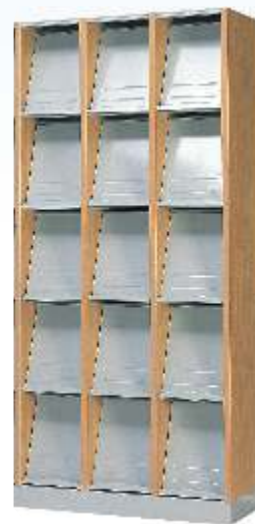
All dimensions are in mm. Accessories shown are not a part of our standard product offering.

OPOS • DESKING • SEATING • STORAGE • INTERIORS