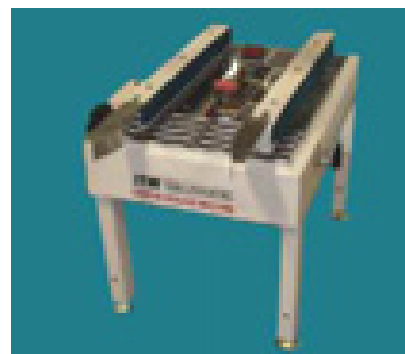
Bottom Sealer - an accessory to the 5FAM

The 5FAM is a fully automatic carton sealing machine with a four flap closer which seals the carton with BOPP Tape on both top and bottom simultaneously. Easy to operate, ensures perfect sealing even of tall and heavy cartons. 5FAM is the latest in the range of carton sealing machines from ITW Signode, the leader in industrial packaging solutions committed to improving your productivity and profitability. 5FAM machines are designed for reliable, high speed tape application.