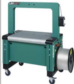
LBX - 2300 Offline Plastic Strapping Machine