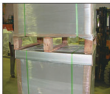
Paper Reams Palletization - replacement of wood for recyclable export packaging