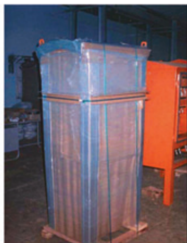
Control Panel Packaging- wood replacement for a moisture sensitive product