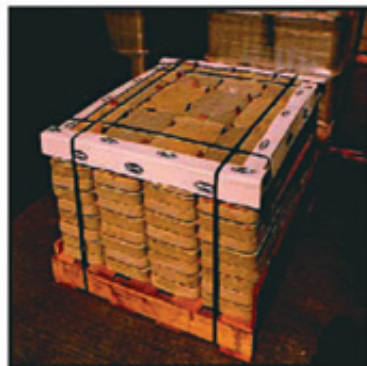
Pavers Palletization- an outdoor application