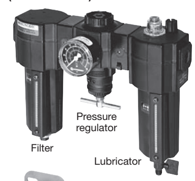
Filter-Regulator-Lubricator assembly (Part No. 424773)

Note: Use light hydraulic oil in lubricator, such as Non-Fluid Oil No. LS-1236 (Part No. 008556) or equivalent.