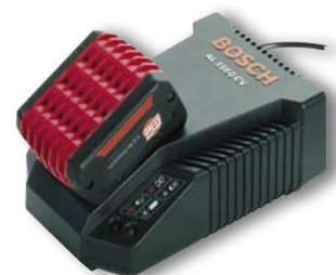
Charger and two batteries included