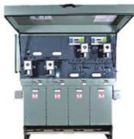
4 PANEL RMU WITH PT PANEL