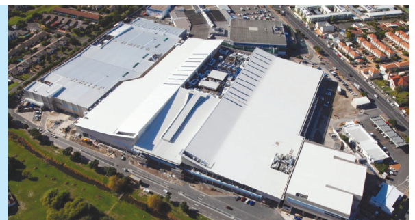
Scheltema Blue Route Mall, Cape Town, South Africa

COLORBOND® Ultra steel with base metal thickness of 0.30 mm to 1.30 mm, metallic coating AZ200 (minimum 200g/m 2 coating mass), Grade G550 (minimum yield strength 550MPa) or G300 (minimum yield strength 300 MPa), with especially developed corrosion inhibitive primer for the exterior top coat of Super Durable Polyester paint system. The total paint coating thickness is 40 µm, on exterior side - 20 µm Super Durable Polyester paint over 5 µm primer and on reverse side - 10 µm polyester paint on over 5 µm primer. The exposed paint system have stable inorganic pigments for better color performance – chalking, fading and gloss property conforming to AS/NZS 2728 type-4 / IS15965 class 3. Fasteners on COLORBOND® Ultra steel to comply with Australian Standard AS 3566 Class 4 or equivalent. Flashing or ridge capping should be manufactured from the same material as used for the roofing. The coated steel has marking (product details, date, mfg. name, etc.) on back side at regular interval confirming genuinity of the material.