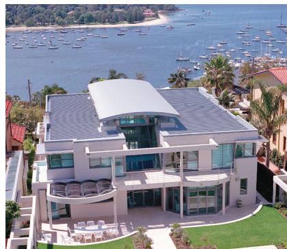
Residential Building, Australia