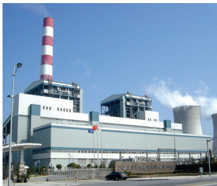
Shanghai Wujing Power Station, China