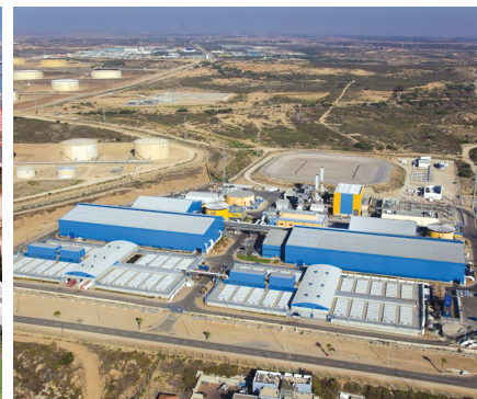
Water Treatment Plant, Tamil Nadu