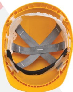
Plastics with Ratchet Suspension