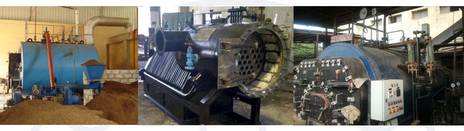
Husk Fired Boiler