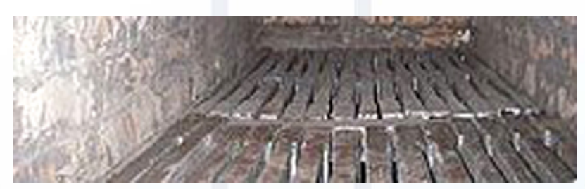
Grate for Solid Fired Boiler